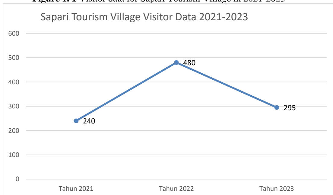
Figure 1. 1 Visitor data for Sapari Tourism Village in 2021-2023

(Source: The Chairman of Tourism Awareness & Researchers, 2024)